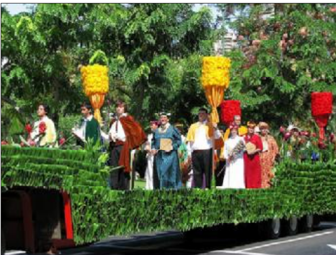
PHOTO CREDITS: Pā'ū rider, Royal Court and Hawaiian Airlines floats by PHOTOlulu Pooper Scooper by Aloha Festivals